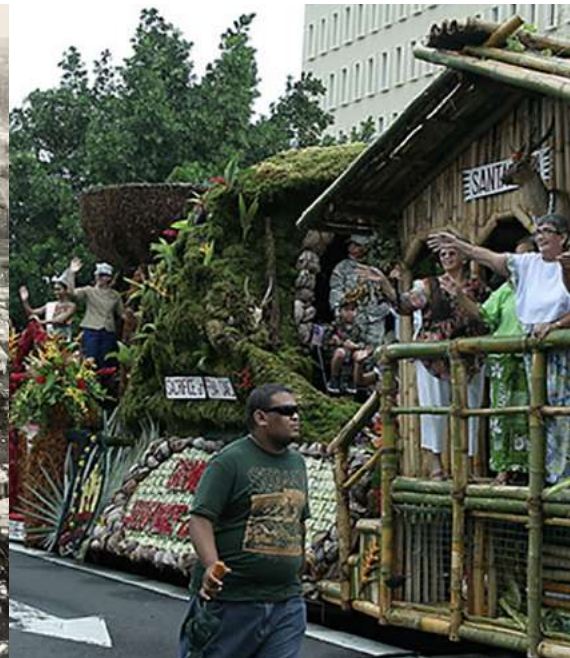
1944 Survivors of World War II • MARC 1962 Typhoon Karen, Dededo • 2010 Santa Rita Liberation float

In this newsletter, we also recognize the memory and spirit of the events and people that died and those that survived the Japanese Occupation and American recapture of Guam during World War II. Liberation Day, for all its complicated meanings, is still an important holiday for the CHamoru/Chamorro people. In the Northern Marianas, Liberation Day is celebrated on July 4th, commemorating the opening of the civilian internment camps at Susupe, Saipan and on Tinian. In Guam, July 21st commemorates the American invasion and eventual liberation of the CHamorus/Chamorros from the concentration camps and the end of Japanese military rule. War, like typhoons, brings fear, confusion, devastation and humility. Both require long periods of recovery and reconstruction—and restorative energy. According to the CHamoru/Chamorro calendar, we reached the end of Mananaf, “to crawl on all fours,” an act of humility, and approaching the beginning of Semu. Wars and typhoons are catalysts of great change. We have been humbled by our experiences, and move forward to a new moon and new possibilities.