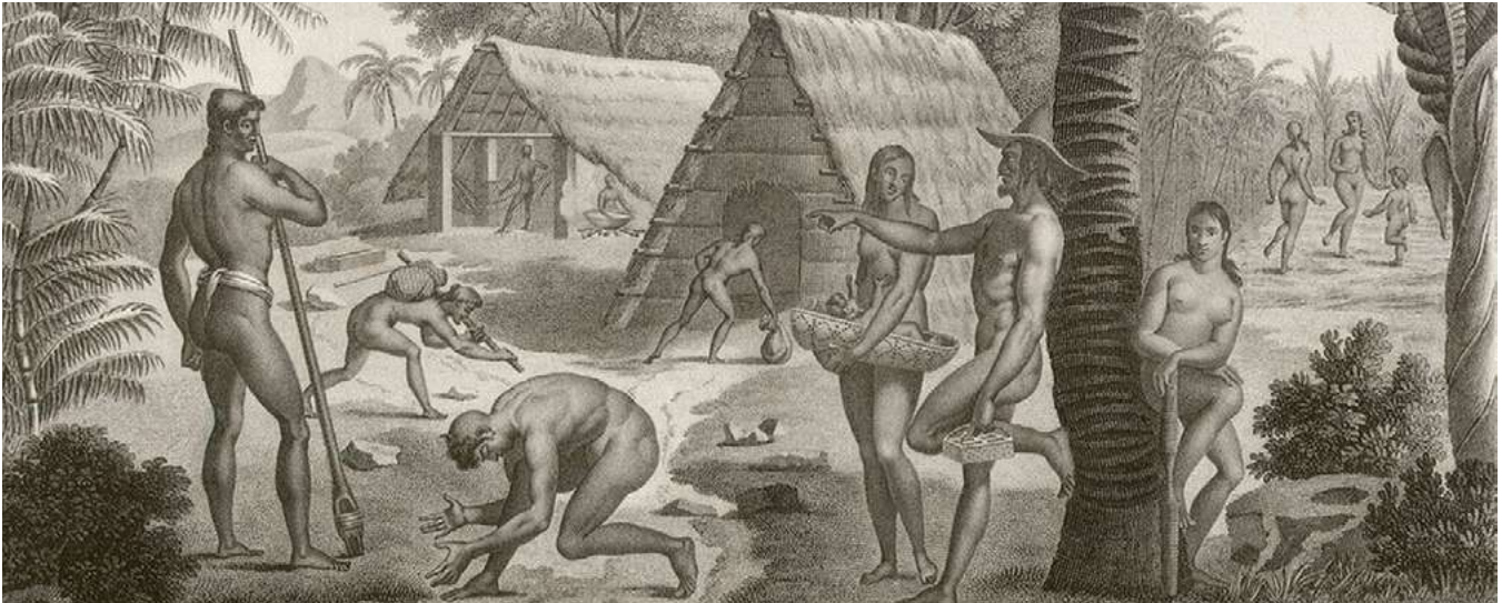
Image: A village scene of the Ancient Chamorros illustrated by J.A. Pellion from Freycinet's Voyage Autour de Monde , Paris, 1824

This month's newsletter starts with a mystery: What exactly does the pu lan Maimo' signify? In the CHamoru/Chamorro lunar calendar, many of the months have direct translations or are associated with distinct activities or weather conditions. However, with the second month of Maimo', we currently have no definitive meaning. To find an explanation, we reached out to local historians and cultural practitioners.