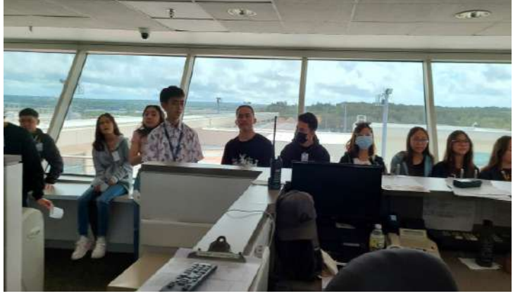
Interns listen to a briefing while visiting the tower/Ramp Control during a comprehensive tour of the terminal on July 7, 2022.