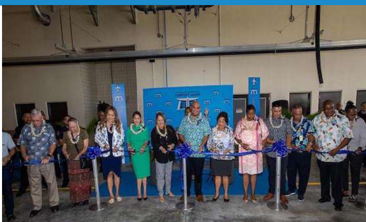
Governor Lou Leon Guerrero, LT Governor Joshua Tenorio, members of the legislature and GIAA, and FAA representatives prepare to cut the ceremonial ribbon.