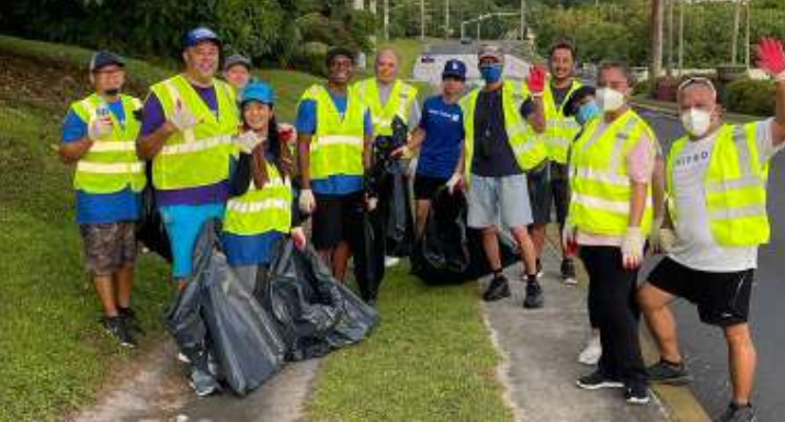
CLEANING UP. Airline partners from Japan Airlines and United Airlines take a break from picking up trash in Tiyan to pose for a group photo, at this year's Islandwide Beautfication Clean Up on July 16, 2022.