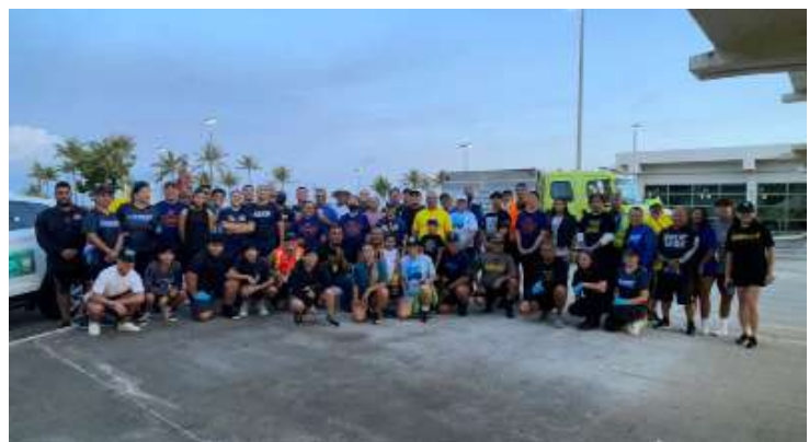
GIAA management, staff, and summer interns gather together after a safety briefing, before heading out to pick up trash in Tiyan and along Route 10-A.