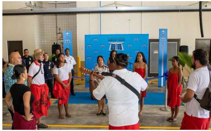
Governor Lou Tenorio and LT Governor Joshua Tenorio join in with Para I Prubechun I Taotao-ta for a CHamoru blessing of the facility at the start of the ceremony.