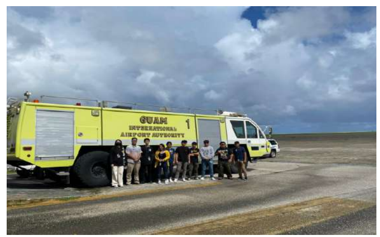
Interns are seen in front of a GIAA Aircraft Rescue & Fire Interns gather together on the runway in front of a Light-Fighting (ARFF) truck, during a tour of the airfield and the ed Runway Closure Sign, a pilot visual aid, during an airfield ARFF Station.