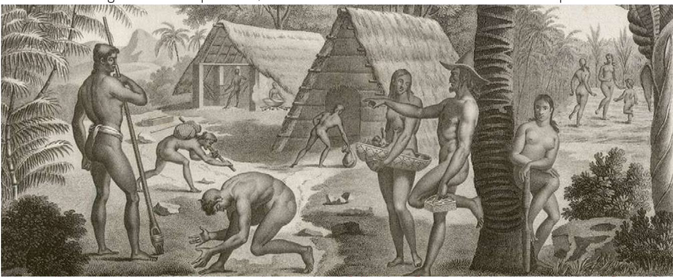
Image: A village scene of the Ancient Chamorros illustrated by J.A. Pellion from Freycinet's Voyage Autour de Monde, Paris, 1824

This month's newsletter starts with a mystery: What exactly does the pulan Maimo' signify? In the CHamoru/Chamorro lunar calendar, many of the months have direct translations or are associated with distinct activities or weather conditions. However, with the second month of Maimo', we currently have no definitive meaning. To find an explanation, we reached out to local historians and cultural practitioners.