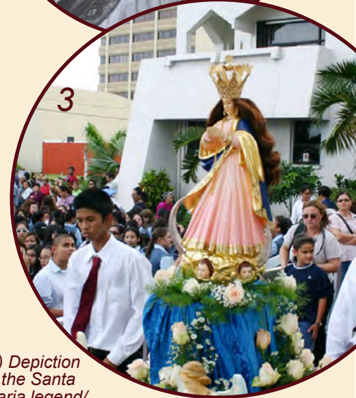
(1) Depiction of the Santa Maria legend/