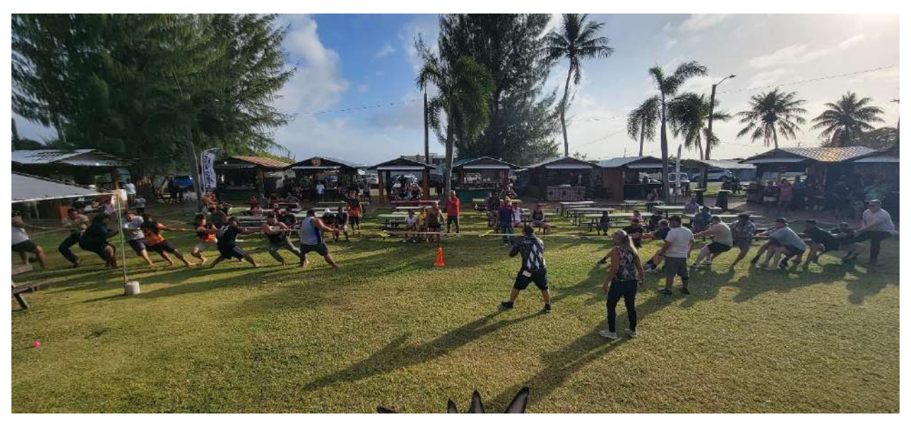
The San Jose Parish Crusaders tugged the hardest to top the tug-of-war contest at the 19<sup>th</sup> Annual Tinian Hot Pepper Festival, held on Feb. 18-19, 2023, in San Jose, Tinian, in The Marianas.