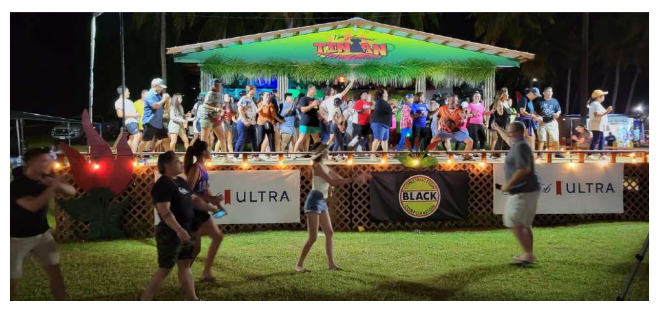
The crowd participates in a group dance at the 19<sup>th</sup> Annual Tinian Hot Pepper Festival, held on Feb. 18-19, 2023, in San Jose, Tinian, in The Marianas.