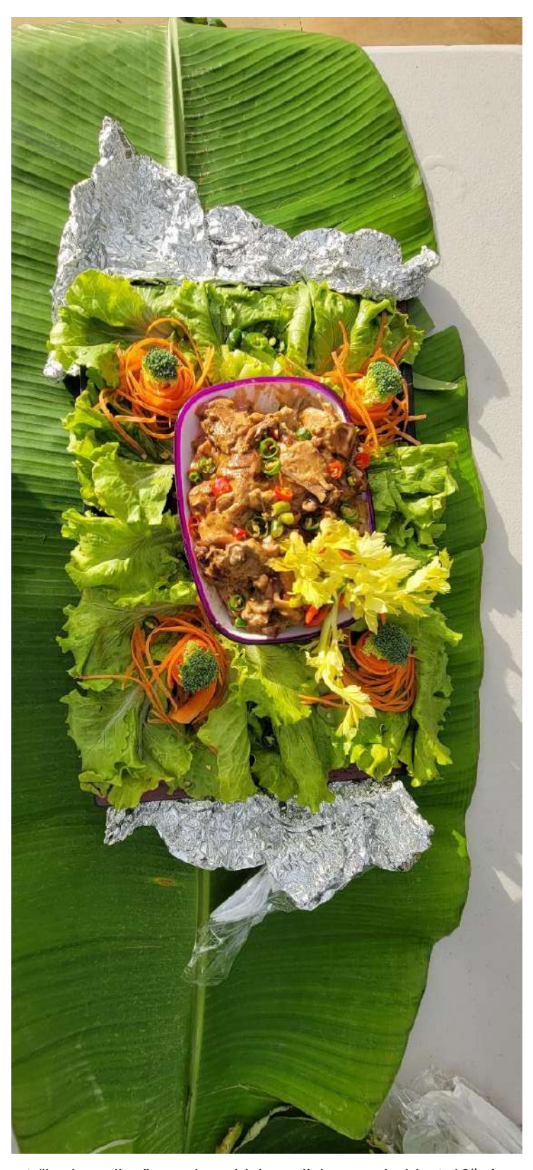
Competition for the best "kadun pika," a spicy chicken dish, was held at 19<sup>th</sup> Annual Tinian Hot Pepper Festival, held on Feb. 18-19, 2023, in San Jose, Tinian, in The Marianas.