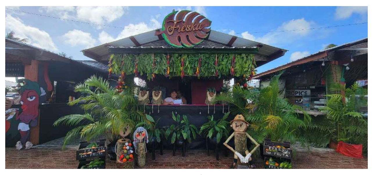
Honors for best decorated booth went to Fresku at the 19<sup>th</sup> Annual Tinian Hot Pepper Festival, held on Feb. 18-19, 2023, in San Jose, Tinian, in The Marianas.